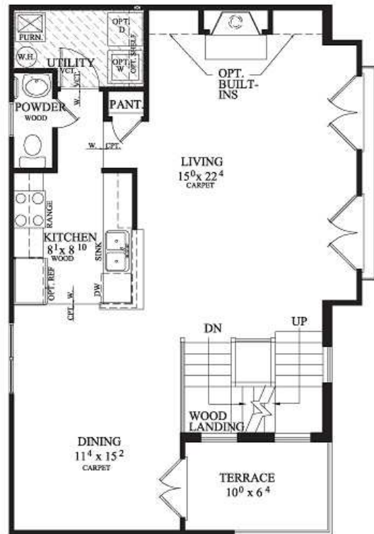
First Floor 720 SQ. FT.