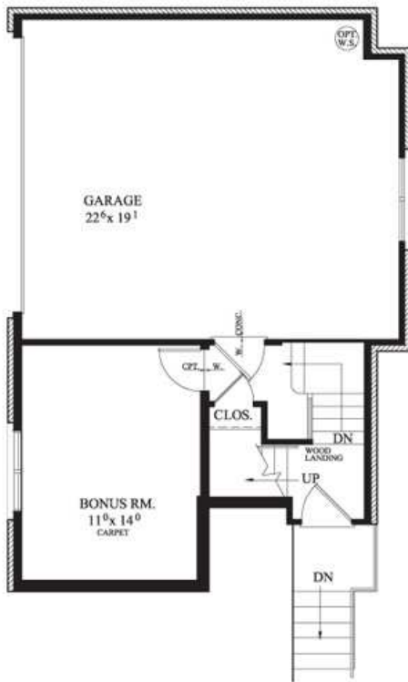
Basement 685 SQ. FT.