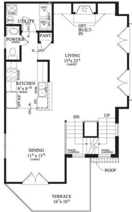
First Floor 705 SQ. FT.