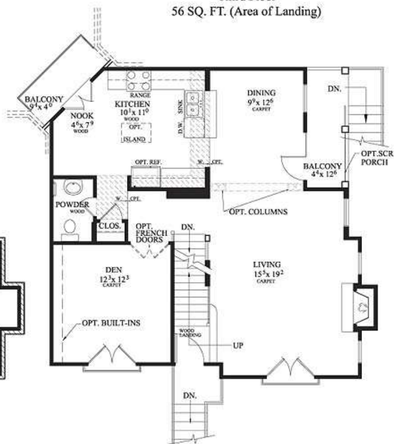
First Floor 893 SQ. FT.