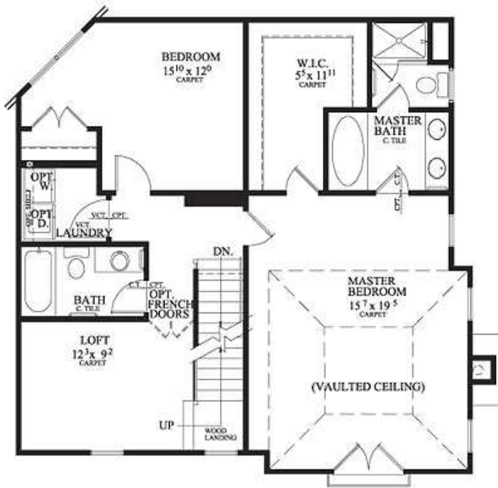
Second Floor 942 SQ. FT.