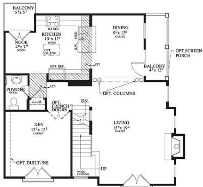
First Floor 880 SQ. FT.