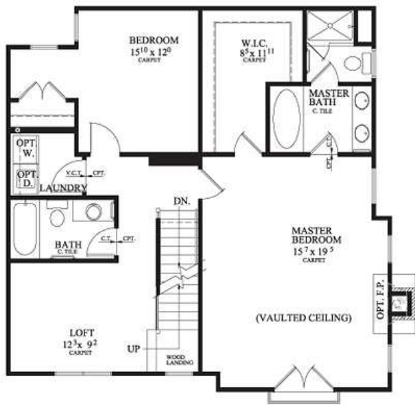
Second Floor 937 SQ. FT.